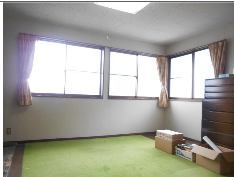
3階 洋室 10帖